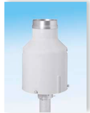
OTT Pluvio 2 400