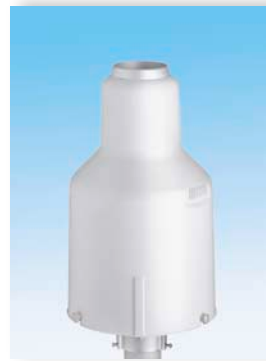
OTT Pluvio 2 200

Both versions are optionally available with ring heating.