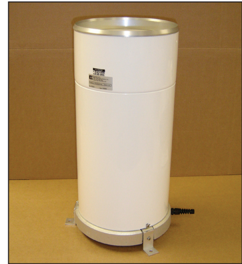
370 Precipitation Gauge

When a precise amount of precipitation is collected in one side of the bucket, gravity tips the assembly and activates a reed switch. A momentary electrical contact closure is provided for each increment of rainfall. The sample is discharged through the base of the gauge.